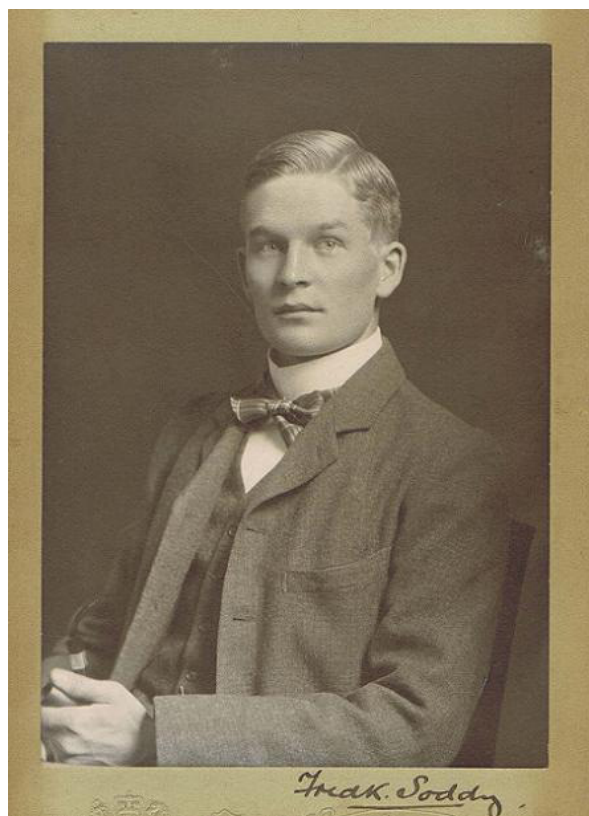
Figure 2. Portrait of Frederick Soddy (1877-1956) from the earliest years of the twentieth century.